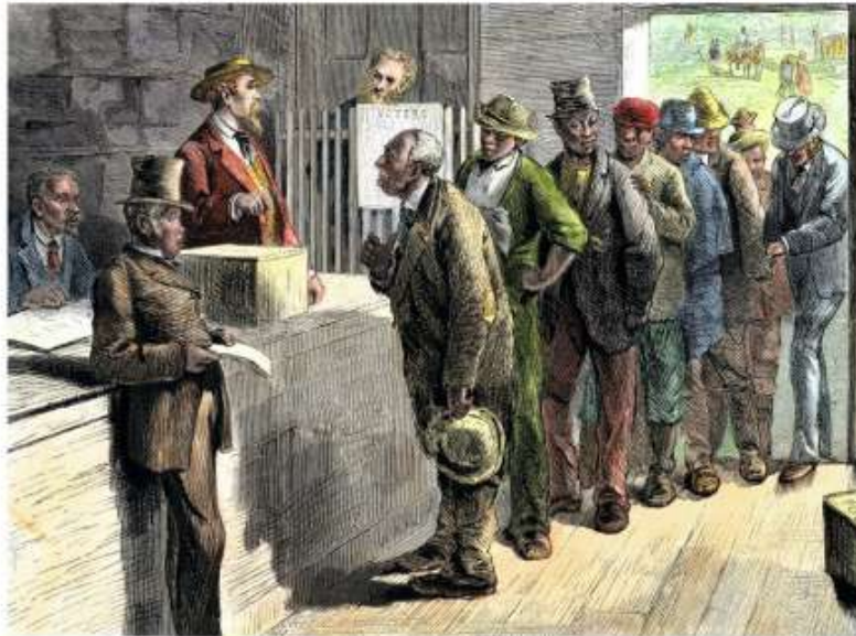
African-American Citizens Voting in Richmond, Virginia, 1871