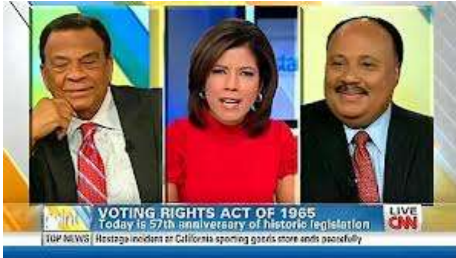
Still Fighting to Maintain Our Right to Vote ( Kill the Voter ID "Law" in 2012 )