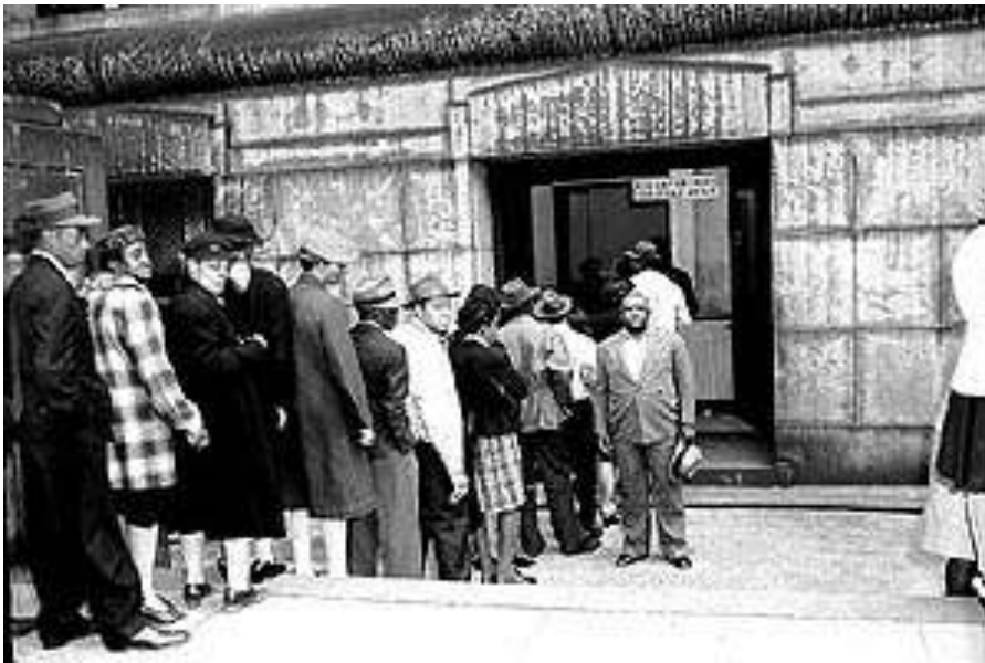
In the Long Line to Vote in the 1960's