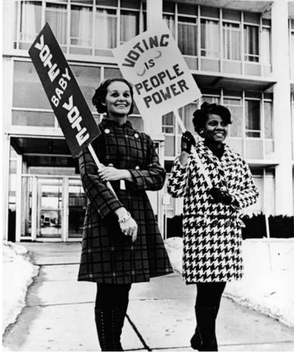
Two Sisters standing outdoors and holding signs reading 'Vote Baby Vote' and 'Voting is People Power,' for Blacks and Women – 1970s