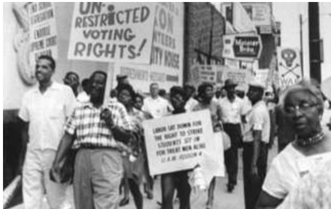
Marching in the Street to earn the Right to Vote 1960s

"The 24th Amendment, which prohibited the denial or abridgment of the right to vote by "reason of failure to pay any poll tax or other tax," was ratified on January 23, 1964. Imagine that you are finally old enough to vote in your first election. But, do you have enough money."