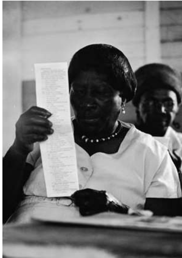
Reading the Ballot