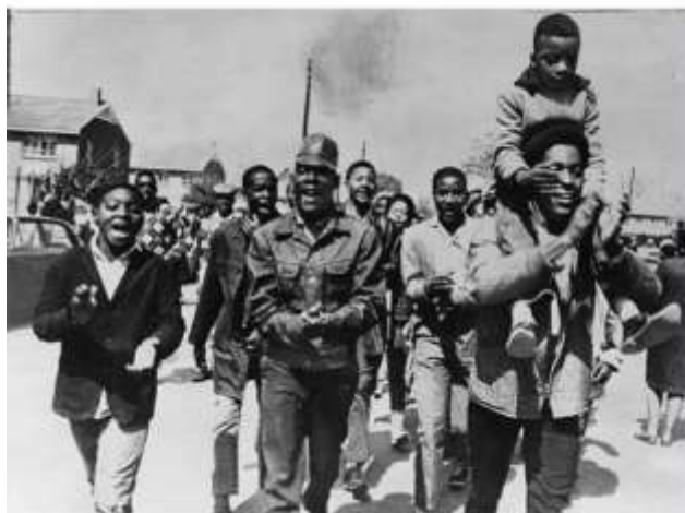
Males Marching to earn the Right to Vote in the 1960s