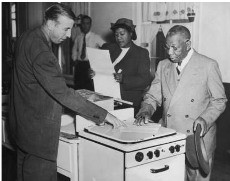
Black Folks Vote for the 1 st Time in Charleston, South Carolina