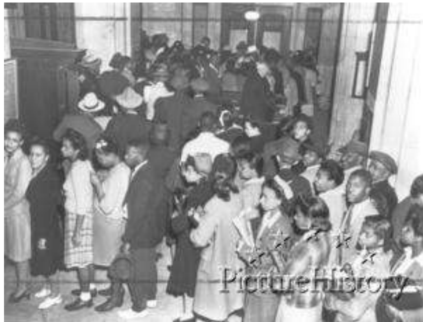
In a Large Crowd to Vote in the 1960s