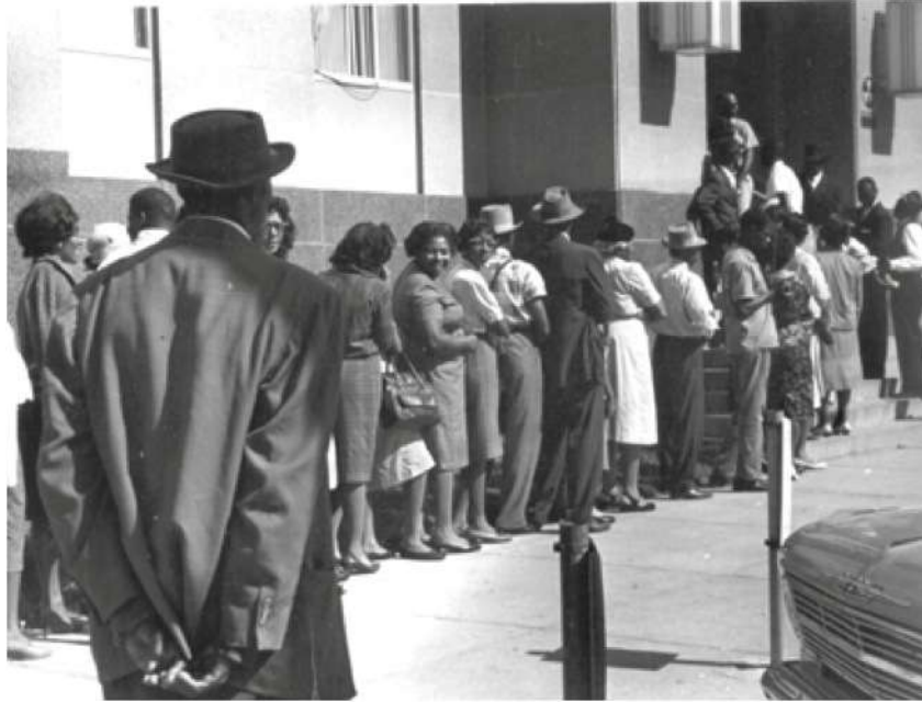
In the Long Line to Vote in the 1960s