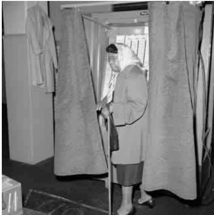
They entered their Vote in the 1960s