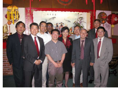
(Here is a picture of Rep. Chu with 80-20 NW Ohio Chapter Officers and Board Members).